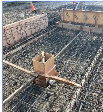
Cement forms constructed