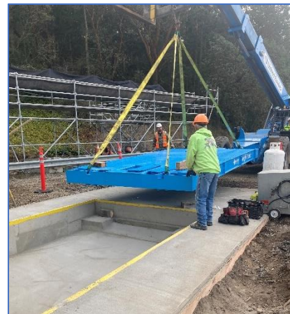
Scales lifted into new forms Nov. 11