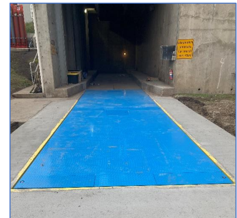
Project complete Nov. 21!