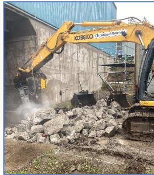
Old Scales removed