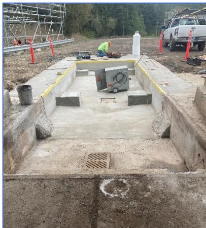
Waiting for cement to cure Nov. 10