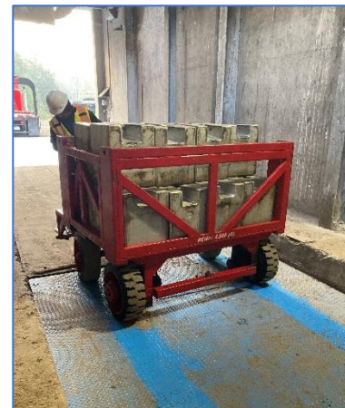
Scales calibrated with 24,000 lb. cart