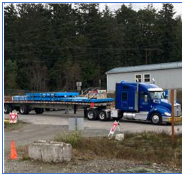
New Scales arrive Nov. 4th

Thank you for your patience with congestion and delays during the project. The facility is back to normal operations as of November 22, 2022.