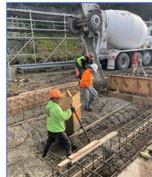
1 st Cement pour Nov. 8th