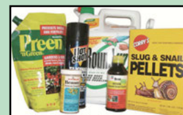
Pesticides & herbicides

QUESTIONS? 360-385-9160 or jeffersoncountysolidwaste.com