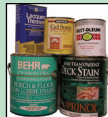
Oil-based paints, stains, solvents