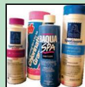
Pool and spa chemicals