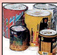
Latex and acrylic paint