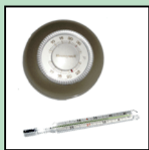
Mercury thermostats & thermometers