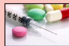
Needles & Medications