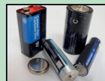
Lithium, button, & rechargeable batteries