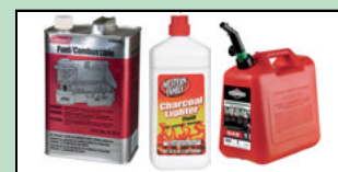
Gasoline and Fuels