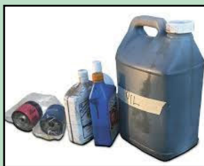
Motor oils & filters