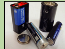
Lithium, button, & rechargeable batteries