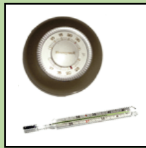
Mercury thermostats & thermometers