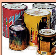
Latex & acrylic paint