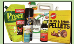
Pesticides & herbicides