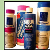
Pool and spa chemicals