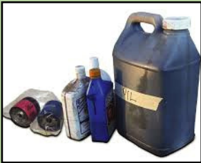
Motor oils & filters