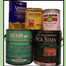
Oil-based paints, stains, solvents